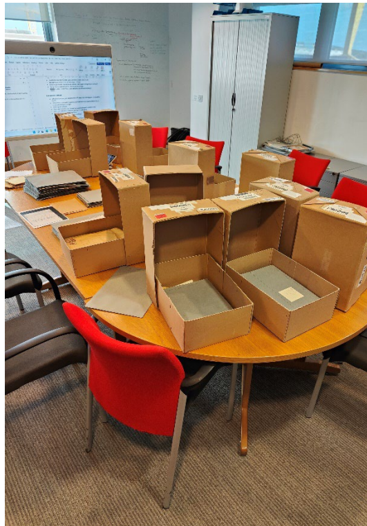
Boxes of Research Files out for organisation.