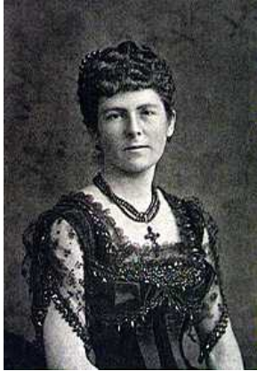
Countess of Dufferin

Lady Dufferin's papers as Vicereine, and her subsequent Indian papers, are also of importance. They include 53 photographs and negatives taken from an album entitled 'My first efforts in photography, India, 1886, Hariot Dufferin'. The photographs show aspects of life in India and Burma during Dufferin's viceroyalty. There are also papers relating to the Countess of Dufferin's Fund (administered by the National Association for Supplying Female Medical Aid to the Women of India), comprising minutes, 1885-1913, accounts, 1888-1913, correspondence, 1885-1914, annual reports, 1888-1916, and speeches, appeals, addresses, publications and newspaper cuttings about the work of the Fund, 1887-1915. In addition, Lady Dufferin kept a long series of journals, 1872-1896, some of them edited and published by her during her very long widowhood, and many of them constituting an important addendum to her husband's successive official missions.