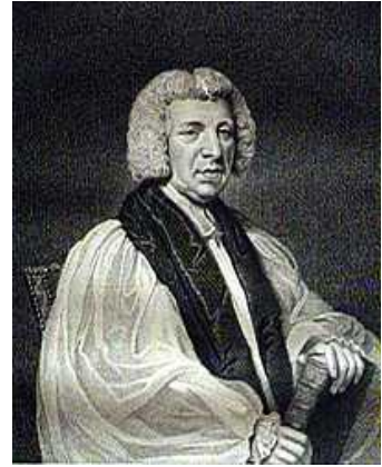
Thomas Percy, Bishop of Dromore

Just as not quite all of the Cape material is to be found in the Cape section, so the Cape section contains material either of wider relevance than, or of no relevance to, The Cape. One of Lord Caledon's letter-books (D2431/5/9) includes correspondence about the Tyrone Militia, Irish estate financial and political affairs, law and order in Co. Tyrone, Lord Caledon's appointment as Lieutenant of that county, etc, 1803-1804, and 1811-1831. The correspondents on these topics include Bishop Percy of Dromore, the 11th Lord Blayney (Lord Caledon's brother-in-law), and the Chief Secretaries for Ireland, Robert Peel and E.G. Stanley. In short, this material dovetails with the Caledon personal and political correspondence in D2433/B-C.