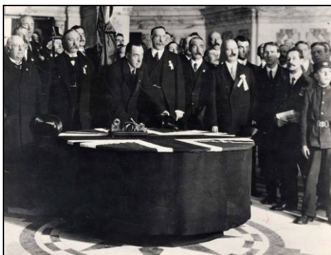
PRONI Reference Number INF/7A/2/47

218,206 Ulstermen, and a further 19,162 men of Ulster origin living outside Ulster, signed the Covenant, while 228,991 Ulster women and a further 5,055 expatriate Ulster women, signed the Declaration.